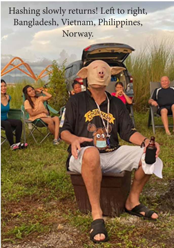
Hashing slowly returns! Left to right, Bangladesh, Vietnam, Philippines, Norway.

Guildford H3 were helping with the Fox Way Ultra r+n, manning one of the first aid posts. They also had three hashers 'who quite frankly are all old enough to