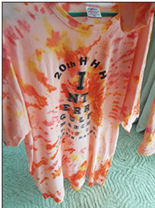
The last international hash gathering before COVID-19!